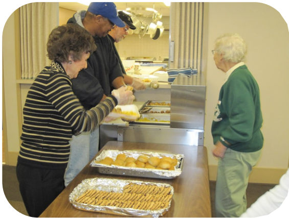
Staff & Volunteers serving lunch at a Lunch Club